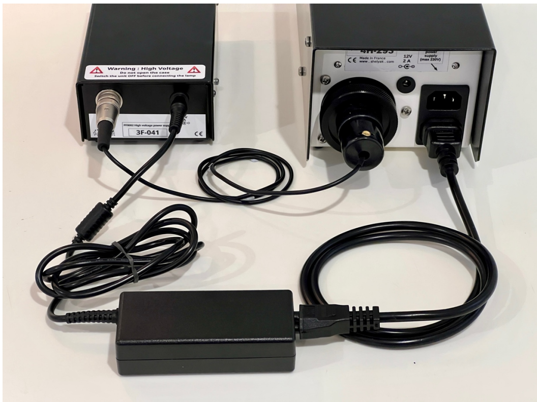
Figure 2: Rear power supply and calibration unit connections.

Connect the 12V DC 5A power supply to the calibration unit with the supplied AC patch cable.