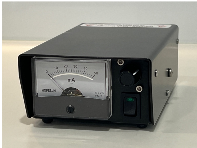
Figure 1: The new high voltage power supply

From 2024, the eShel's high voltage power supply is powered via a 12V 5A DC adapter. This adapter is plugged into and is controlled by the calibration unit. The calibration unit itself utilises two power sources; a 12V DC 2A power supply, and a direct AC connection.